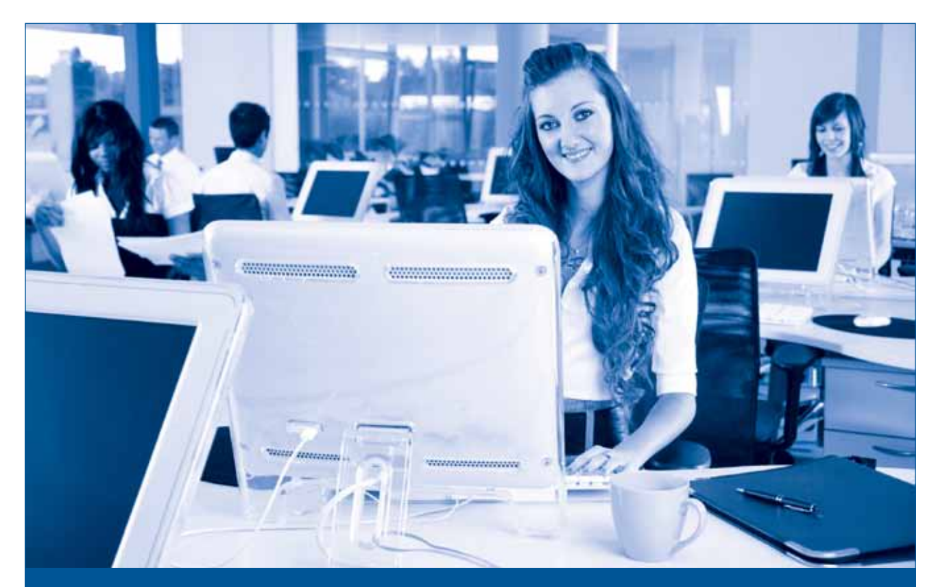
The (presumably unintended) consequence is that employers will invariably prefer to engage external data privacy officials in the future as opposed to employee data privacy officials, as the former will be easier to remove.

employees, the German legislature has made very little progress on enacting such a statute. Cynics stated that it would be naïve to expect the German legislature to debate and enact such a fundamental statute in 2009, i.e. , shortly before Germany's federal elections in late September.