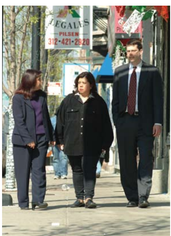
One of the National Immigrant Justice Center's offices serves Chicago's Pilsen community, a destination for immigrants from many different cultures for over 100 years.

he said. "The difference with asylum cases is that, if I lose, my client may be sent home to face persecution -- or even death -- at the hands of government agents. But if I win for a client like this one, she can stay