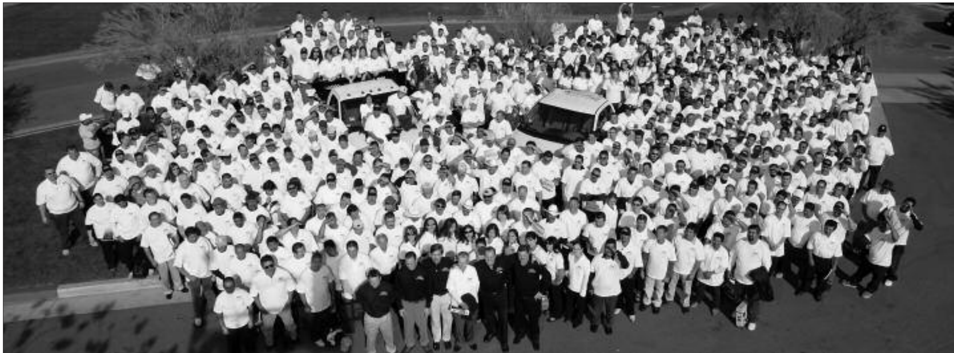
The Teserra founding partners (black shirts) and staff get together prior to the company's recent re-branding ceremony.

Coachella Valley-based California Pools and Spas recently announced that it is changing its name to Teserra to more accurately define its full complement of product and service offerings – from pools and spas to landscaping design and installation to fire pits and outdoor kitchens and flooring. The company serves Coachella Valley and other Southern California homeowners predominantly through its relationships with some of the region's top homebuilders.