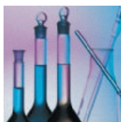
An Assessment and Comparison of New TSCA and REACH