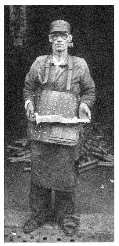
FIGURE I: Steel-bradded leather aprons are worn by casting grinders at the American Steel Foundries to protect the abdomen from vibrations